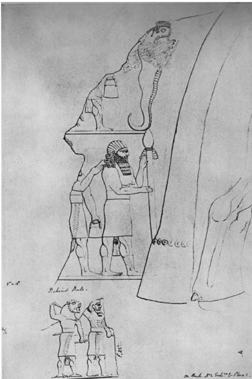
Figure 2.4. Winged Snake, from the Southwest Palace. Reproduced from Barnett and Falkner, The Sculptures of Assur-nasir-apli II (883-859 B.C.), 164, plate CXII.