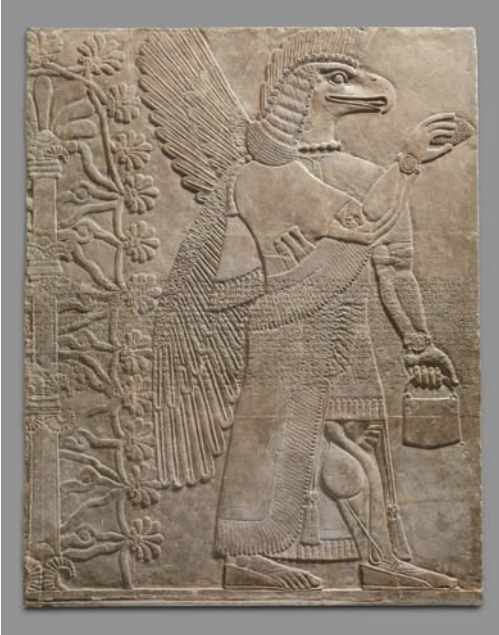
Figure 2.1. Bird-headed Genie with Multiple Wings. Metropolitan Museum 31.72.3.