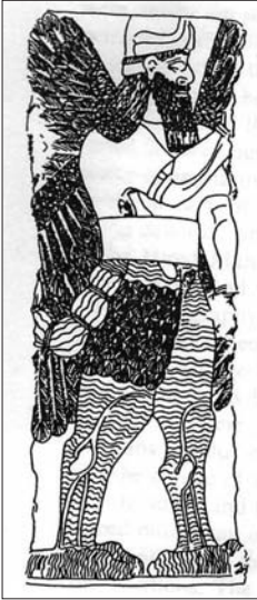
Figure 2.3. Scorpion Man, Limestone Relief from the Northwest Palace at Nimrud. Reproduced from Huxley, "The Gates and Guardians in Sennacherib's Addition to the Temple of Assur." fig. 7.