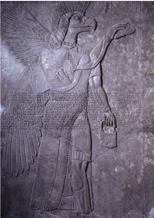
Figure 2.2. Bird-headed Genie with Multiple Wings. BM 98064.