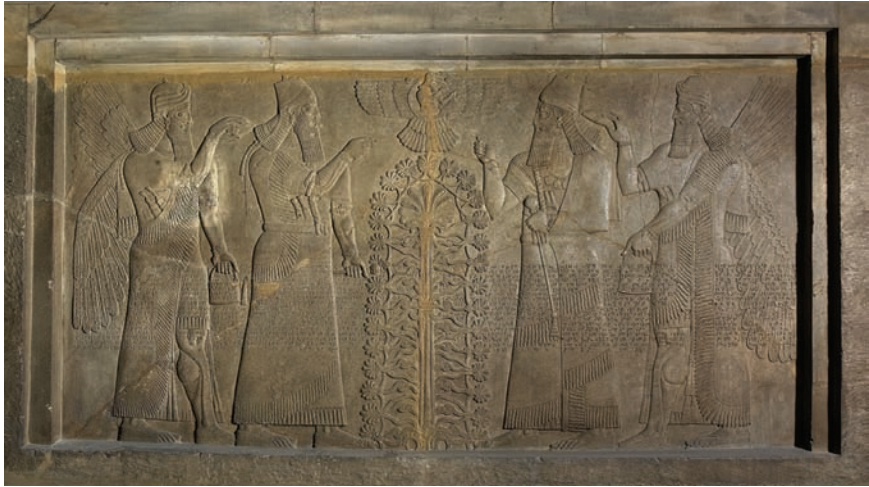
Figure 2.5. Pivot Relief. BM 124531.