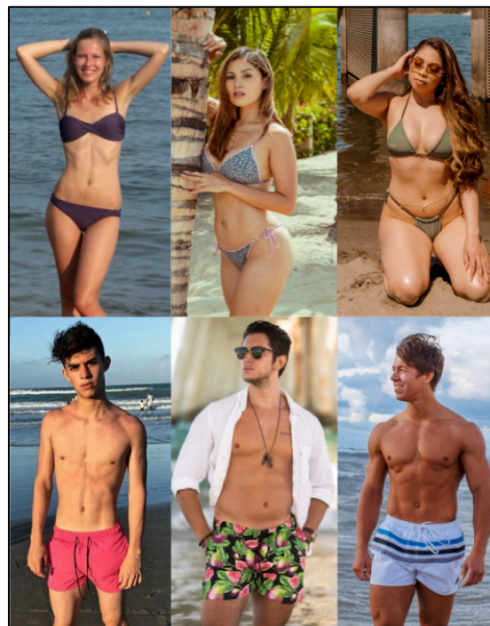
Figure 1: Examples of images picked for each body type category

Based on the responses obtained, 5 pictures were selected depending on the scores they received on the thinness-muscularity/curvaceousness spectrum for each gender and each body type (see Figure 1). Overall, female stimuli were rated lower than male stimuli on the thin-curvaceous scale. Participants did not use the full scale when scoring female bodies, avoiding high thinness or curvaceous rates. For males, scores of 0-3 were considered thin ( M=3.21 , SD=0.67 ), scores 4-7 were considered average ( M=5.32 , SD=0.71 ), and scores 8-10 were considered curvy or muscular ( M=8.16 , SD=0.67 ). For females, scores from 2-3 were considered thin ( M=3.12 , SD=0.68 ), scores 4-5 were considered average ( M=4.93 , SD=0.63 ), and scores 6-7 were considered curvaceous ( M=6.92 , SD=0.35 ). To determine the prevailing beauty ideal, female and male images that approached a score of 10 on the scale were taken to represent the prevailing beauty ideals in the population. The female body ideal was evaluated as average in the first assessment ( M=4.48 , SD=1.80 ) and the closest to the beauty ideal ( M=7.51 , SD=1.89 ). The male body ideal was rated as muscular ( M=7.62 , SD=1.85 ) and closest to the beauty ideal ( M=8.28 , SD=1.73 ) (see Figure 2).