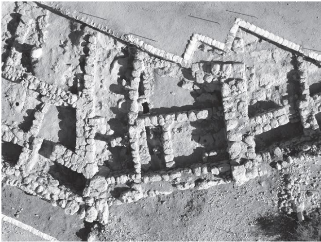
Fig. 5. The southern gate at Qeiyafa, in 2009. Aerial view of the of the Iron Age city: Khirbet Qeiyafa Area C (Garfinkel et al., 2009: 219).