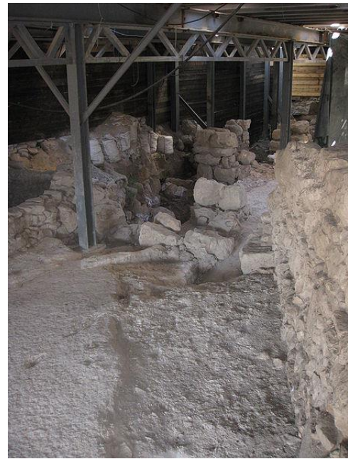
Fig. 3. Part of the Large Stone Structure at the City of David (Deror avi, CC BY-SA 3.0, via Wikimedia Commons)

the United Kingdom of Israel". Pottery from Iron Age IIb (8 th -6 th centuries B.C.E.) was found in the northeastern corner of the building, indicating that the building remained in use until the end of the First Temple period. In addition, the excavators have found a seal of Jehucal son of Shelemiah, son of Shovi, a man who is mentioned in the Book of Jeremiah as official in King Zedekiah's court (597-586 B.C.E.) (Mazar, 2007; Mazar, 2006b).