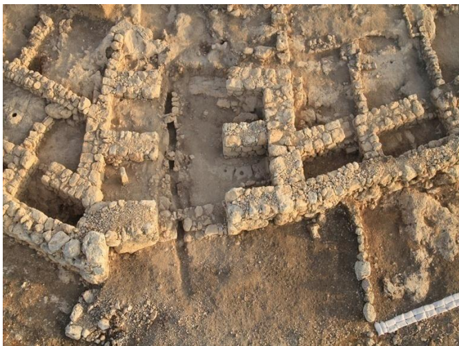
Fig. 6. The southern gate at Qeiyafa, in 2010. Aerial view of the of the Iron Age city: Khirbet Qeiyafa Area C.