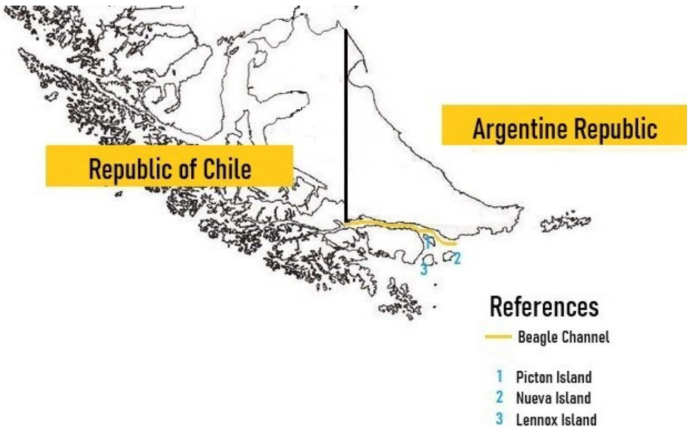
Image N° 2. Picton, Lennox and Nueva, Islands of the Beagle Channel with their sovereignty in dispute until 1984

Therefore, it is possible to argue that just until the signing of the Tratado de Paz y Amistad in 1984, which had a strong and positive impact on the improvement of the bilateral relations of both countries (Church, 2008), the relationship between Argentina and Chile was defined as having a high level of pugnacity because of the conflicts related to the definition of the territorial delimitation between them. The main territorial dispute was linked to the so-called “Beagle Conflict”, that is, the impossibility of reaching an agreement regarding the sovereignty of the Nueva, Picton and Lennox Islands.