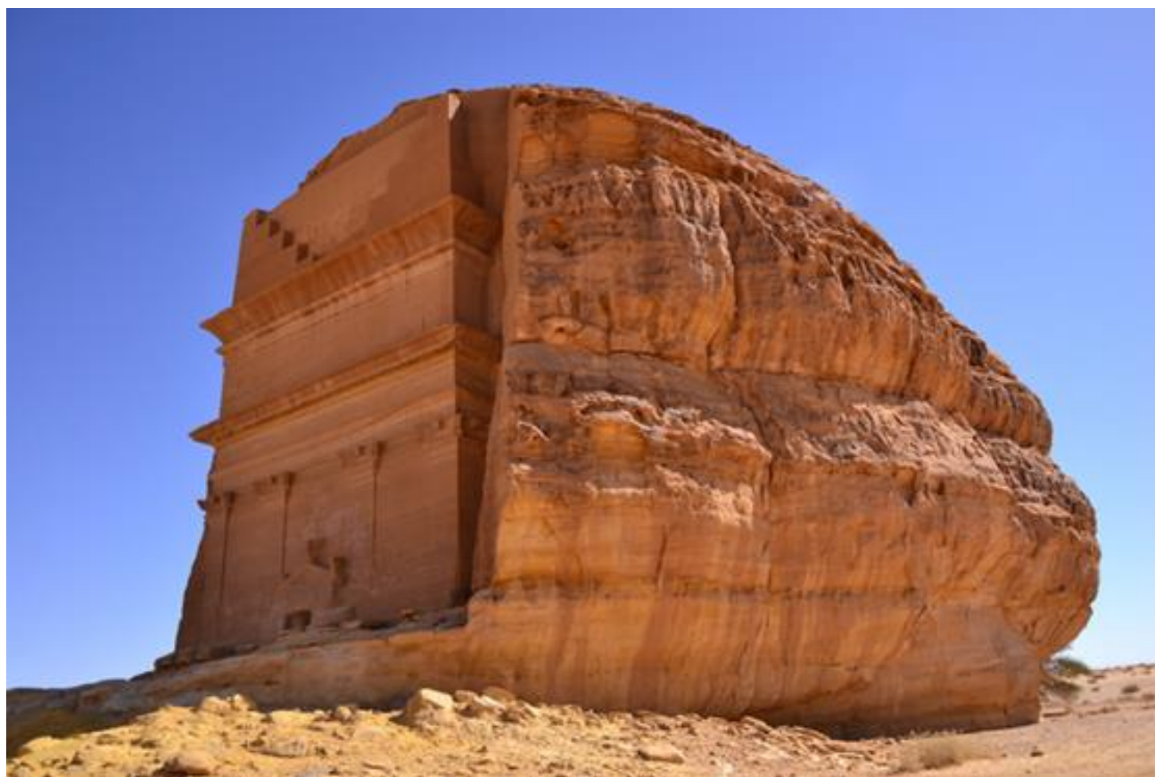
Tumba nabatea esculpida en la roca, Madain Saleh, Arabia Saudita.

envuelto en una cruenta guerra civil entre rebeldes hutíes y el gobierno reconocido por la comunidad internacional. Los bombardeos de la coalición gubernamental dirigida por Arabia Saudita han dañado severamente el patrimonio histórico yemení: según un informe de 2017 1 , la lista de lugares dañados o destruidos comprende 78 sitios, incluyendo seis del Patrimonio Mundial de la UNESCO. Entre ellos, yacimientos de importancia extraordinaria como Marib y Sirwah, capitales del antiguo reino de Saba; la famosa represa de Marib y Baraqis, capital del reino de Main.