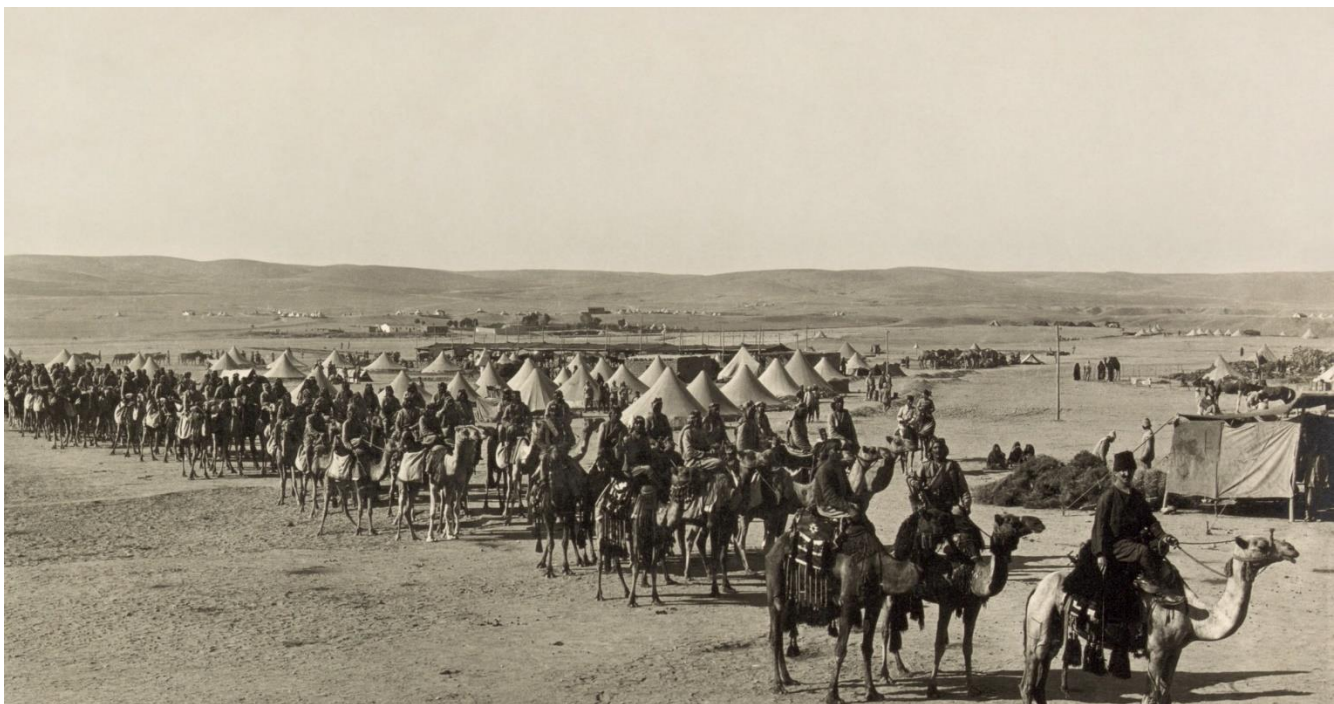
Camel caravan from Beersheba at 1915.

The first beast of burden to become available for human exploitation was the ox. Evidence of early use of cattle for carrying loads on their backs ( boeufs porteurs ) comes from Saharan rock art and is usually dated to the period before the climatic change that caused the verdant Saharan grasslands of deep antiquity to begin drying up beginning around 5000 B.C.E. Bovine animals were also used to carry loads in pre-modern India, Laos, and Tibet. In India, ox-carts could carry larger loads, but terrain difficulties made pack bullocks useful in situations that allowed the animals to graze as they went along.